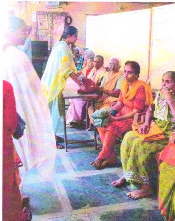
Students donating clothes to Old Age Home people