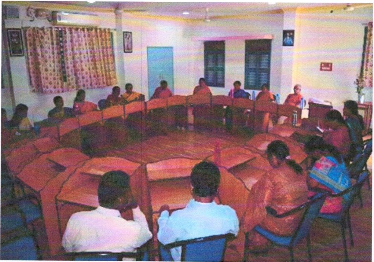
In House Curriculum Meeting